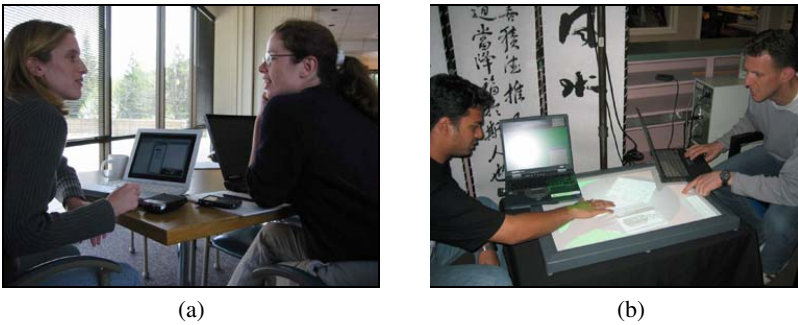
Fig. 1. (a) Collaboration at an airport (reproduced from [4]) (b) Collaboration around an UbiTable

The goal of the UbiTable project is to provide efficient walk-up setup and fluid UI interaction support on horizontal surfaces. We wish to enable spontaneous, unplanned, collaboration where the participants share contents from their mobile devices such as laptops and PDAs. We draw technological underpinnings from peer-to-peer systems [4], ad hoc network protocols (such as 802.11 ad hoc mode, or Bluetooth), and existing authentication and encryption methods. Our focus is on design solutions for the key issues of (1) a model of association and interaction between the mobile device, e.g., the laptop and the tabletop, and (2) the provision of three specific shades of sharing semantics termed Private , Personal and Public . This is a departure from most multi-user systems where privacy is equated with invisibility. Figure 1 (b) shows the current UbiTable setup. Note that UbiTable also provides a variety of digital document manipulation functions, including document duplication, markup, editing, digital ink for drawing and annotation. The elaboration of these functionalities is out of the scope of this paper.